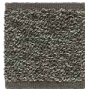
Ash Grey 551