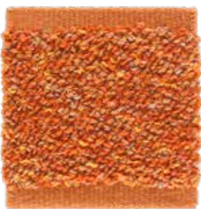
Tangerine Orange 441