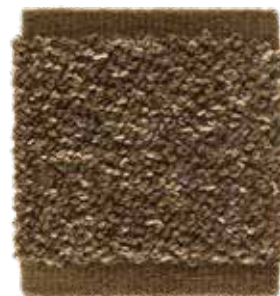
Bark Green 301