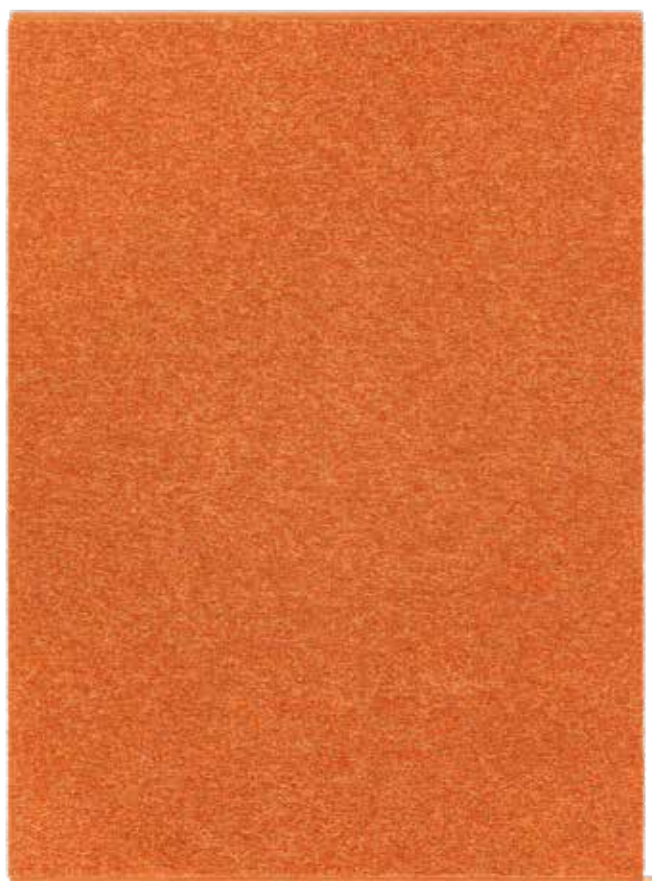
Rug 170x240 cm, Tangerine Orange 441