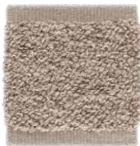
Powder Greige 804