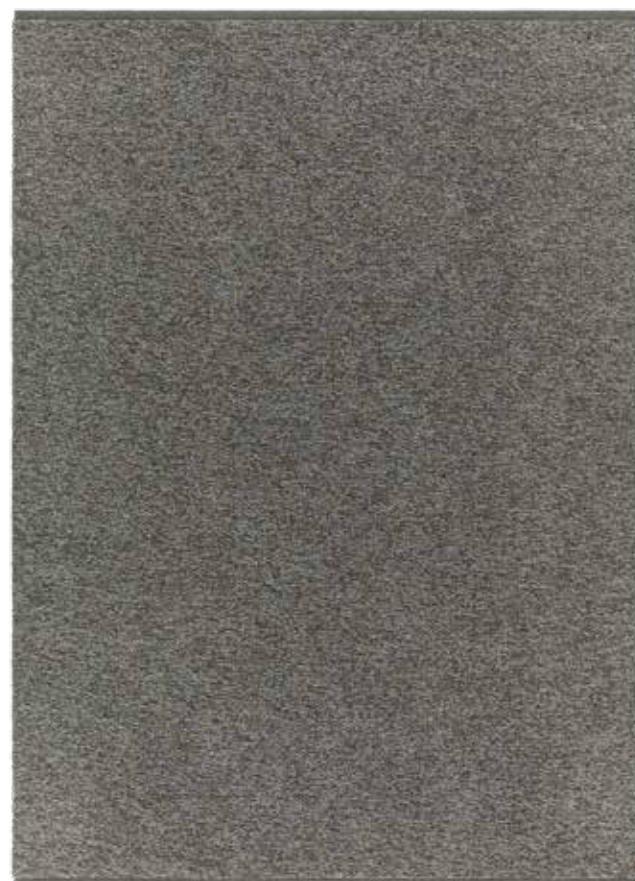
Rug 170x240 cm, Ash Grey 551