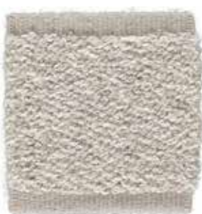
Soft Grey 850-8005